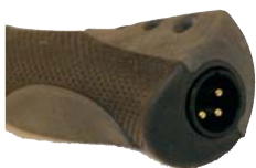
PG2 XLR Adapter Kit

As XLR accessory is also available. This is built into the base of the handle, so that an XLR microphone cable can easily and quickly be plugged directly into the PG2 handle. The 3/8 inch Whitworth thread for the boom pole is then placed further up the handle on a bolt-on adaptor.